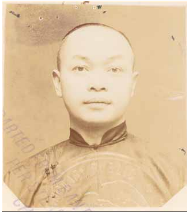
CITIZENSHIP CHAMPION. In the late 1800s, birthright citizenship was legally expanded to the children of immigrants. Wong Kim Ark, who was born in San Francisco in 1873, was returning by steamship from China in 1895 and was denied reentry. He sued and the Supreme Court in 1898 ruled in his favor. The court held that under the Fourteenth Amendment, a child's citizenship depends on birth in the U.S., not a parent's citizenship.

Trump said the decision was "too bad for our Country" and wrongly suggested that congress could "easily" address it with legislation. The majority decision rests on