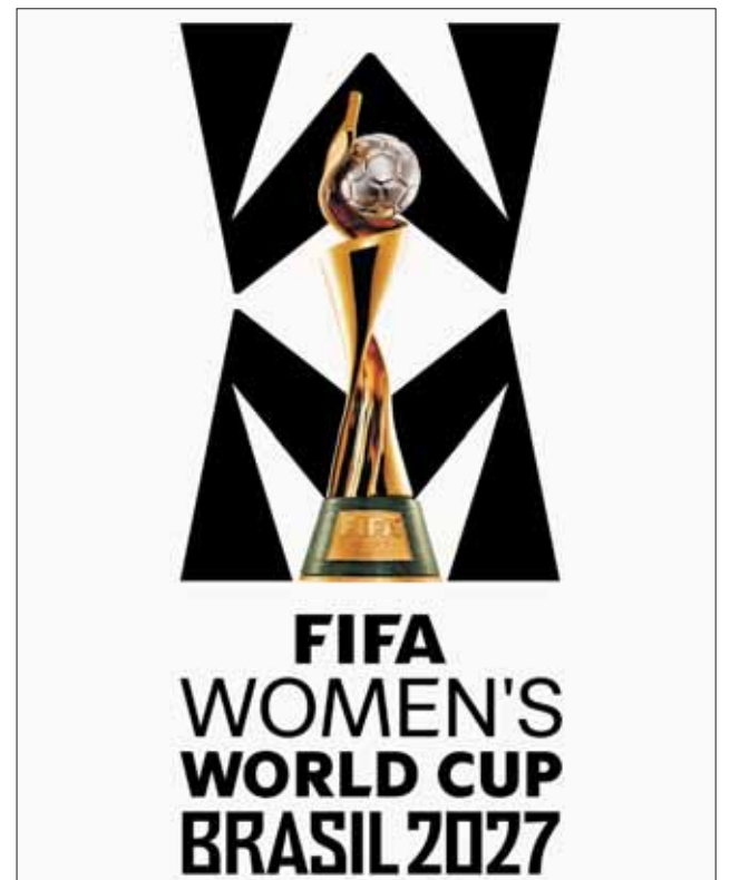
BRAZIL 2027. While most of the soccer world is focused on the men at World Cup North America, the countdown has begun for the 2027 Women's World Cup in Brazil. The women's tournament is set to start June 24, 2027, hosted by a South American country for the first time.

We immediately checked with our server. I said, "Excuse me — we specifically asked you not to put any