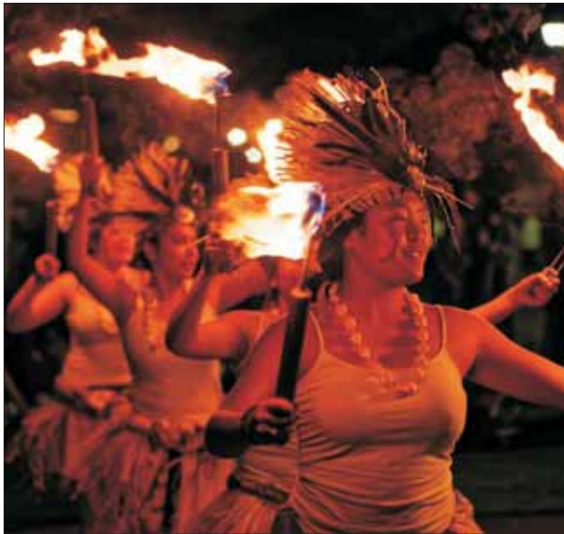
NAVIGATORS OF THE SEA. “Pacific Islanders: Navigators of the Sea,” an exhibit about the art, dance, music, and settlement of people in the Pacific Islands, is on view through July 31 at the World Beat Gallery in Salem.

Aug 1, Seattle Center, Armory Food & Event Hall (305 Harrison St, Seattle). Celebrate Sikh/Punjabi culture at A Day in Punjab, presented by Seattle Center Festál and Sevdar. Activities include free turban tying, Gatka (Sikh martial arts),