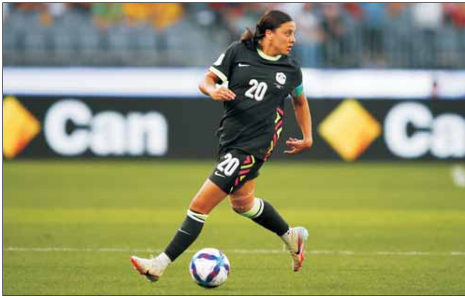
GOAL LEADER RETURNS. Sam Kerr of Australia dribbles the ball during the Women's Asian Cup semifinal soccer match between China and Australia in Perth, Australia, in this March 17, 2026 file photo. Kerr is joining Gotham FC in the National Women's Soccer League after spending the past six-plus seasons with Chelsea.

"I'm incredibly excited to return to Gotham FC and to this city," Kerr said in a statement released by the team. "This club