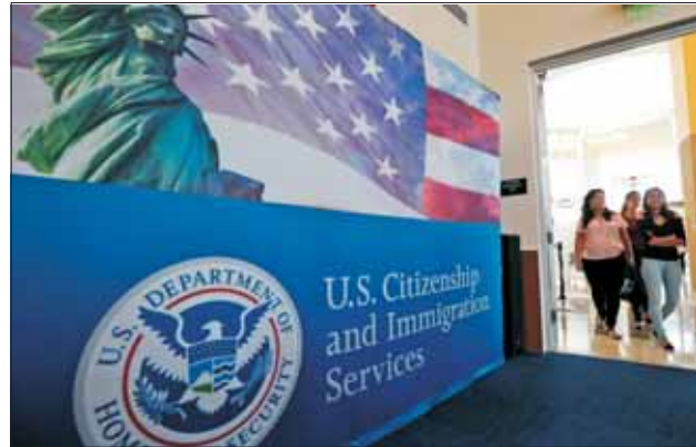
IMMIGRATION UPHEAVAL. People arrive before the start of a naturalization ceremony at the U.S. Citizenship and Immigration Services Miami Field Office in Miami, in this August 17, 2018 file photo. Many Asian American and Pacific Islander adults have experienced or witnessed some degree of upheaval because of the Trump administration's heightened immigration policies, an AP-NORC/AAP Panel poll finds, while most say the U.S. is no longer the land of opportunity for immigrants.

Have The Asian Reporter delivered directly to your home or office and receive a $4.00 discount. See page six for subscription options and an order form. Expiration date: August 31, 2026. Discount applies to new subscribers only.