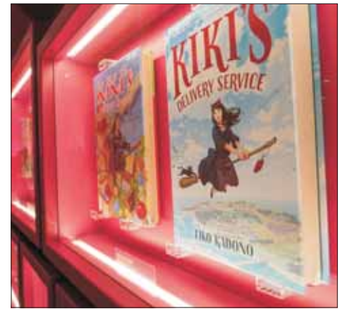
PROLIFIC WRITER. Eiko Kadono, the author of Kiki's Delivery Service, speaks during an interview in Kamakura, Japan. At age 91, Kadono is still writing every day and hasn't stopped loving the color pink, dressing up, or believing in the magic of books. In the top right photo, an English-language edition of Kiki's Delivery Service is displayed at the Kiki's Museum of Literature in Tokyo.

"The other-worldly fantasy that Kadono creates has overcome the boundaries of language, to become appreciated by a wide global audience, including children and adults, and won international accolades," reads a statement in pink lettering on the museum wall.