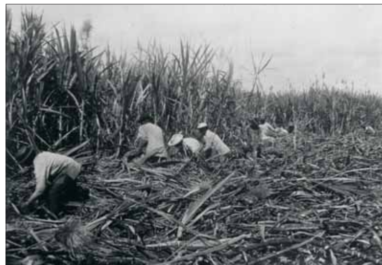
On the right is an undated photo provided by the Hawai'i State Archives that shows workers cutting sugar cane by hand at the Ewa Plantation in Hawai'i. (Hawai'i State Archives via AP)

Filipino American history in Hawai'i typically overlooked