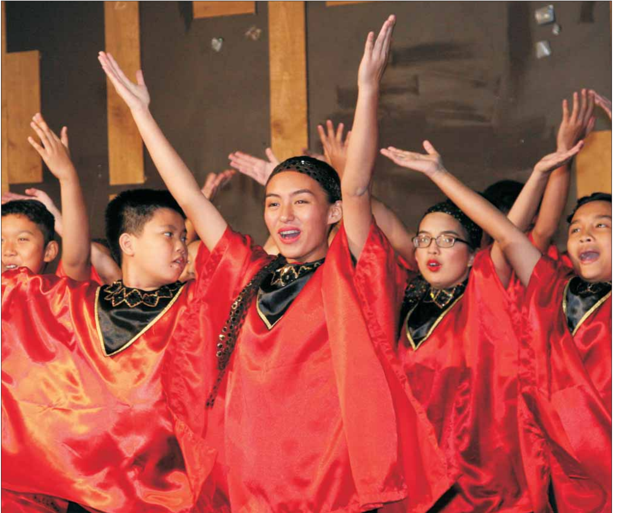
COMMUNITY CELEBRATION. Performers with the Mandaue Children's Choir from the Philippines entertain a crowd of more than 325 at The Asian Reporter Foundation's 19th Annual Scholarship & Awards Banquet held at the TAO Event Center in northeast Portland. The gala event, held in advance of Asian Heritage Month, featured cultural entertainment and recognized the efforts and achievements of Asian-American elders, community organizations, and scholars. Our special section highlighting the accomplishments of our 2017 awardees begins on page 8.